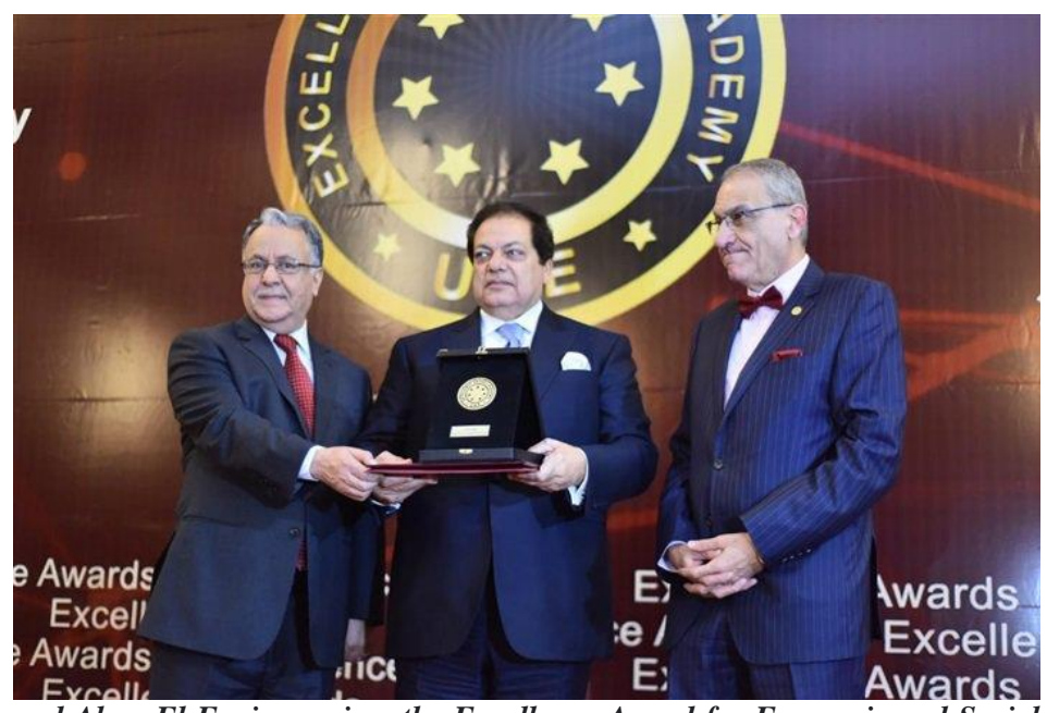
MP Mohamed Abou El-Enein receives the Excellence Award for Economic and Social Initiatives from the Secretary-General of the Council of Arab Economic Unity in a big celebration in Cairo in 2019

* Excellence Award for Economic and Social Initiatives 2019 from the Council of Arab Economic Unity and the Dubai Excellence Awards Academy.