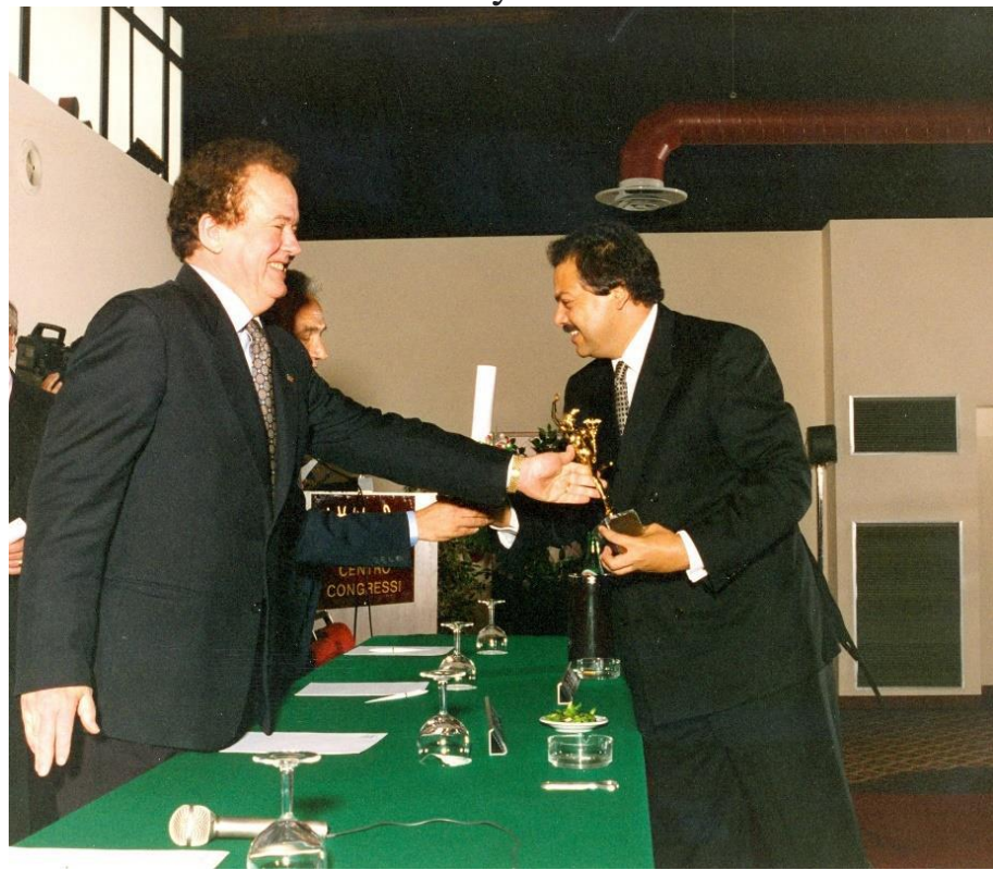
INPEX Corporation Innovation Award from the United States.

* Excellence Award for Economic and Social Initiatives 2019 from the Council of Arab Economic Unity and the Dubai Excellence Awards Academy.